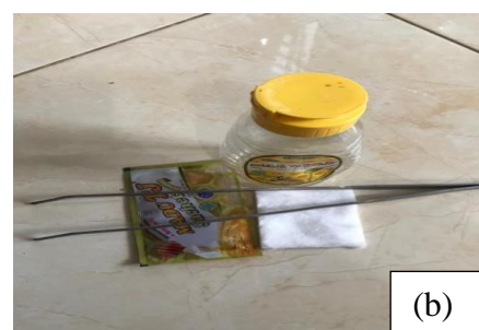
Picture 1 (a) Caterpillar of T. molitor (b) Honey, cotton, and water