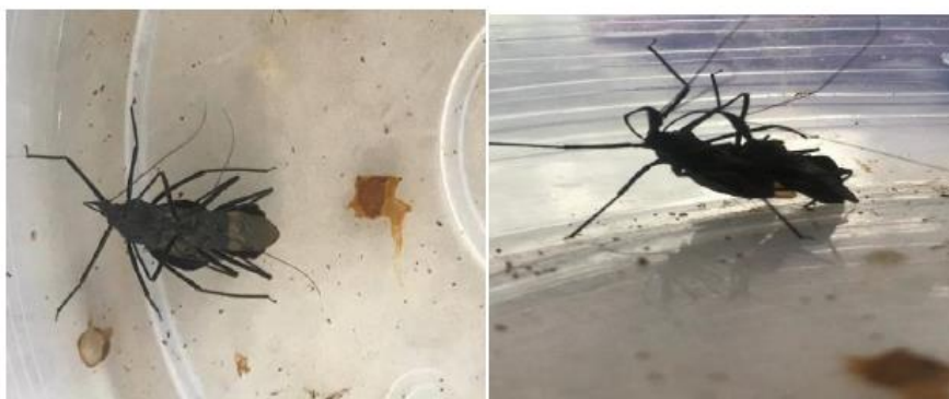
Picture 6 . S. dichotomis copulate

The union behaviour of S. dichotomis conducted with male imago by touchng the female by using the her feet and push the female anterior thorax with the labial tip. After that the male S. dichotomis went to the female body. The copulate happened after the male reach the female body, then male lengthen the genitals until its connected with male's genital. After the copulate the couple of S. dichotomis not making a move. The last copulate charaterized by dropping the male and female antenna down, next the male and female insects separated.