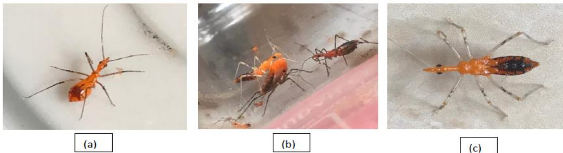
Picture: 11 (a). Nymph of instar 3 S. dichotomus (b). Skin changes process of S dichotomus from instar 3 to instar 4 (c). Nymph of instar 4 S. dichotomus

with the skin changes, and the nymph had just appeared from the skin changes process immediately moved to another jar to avoid the cannibalism.