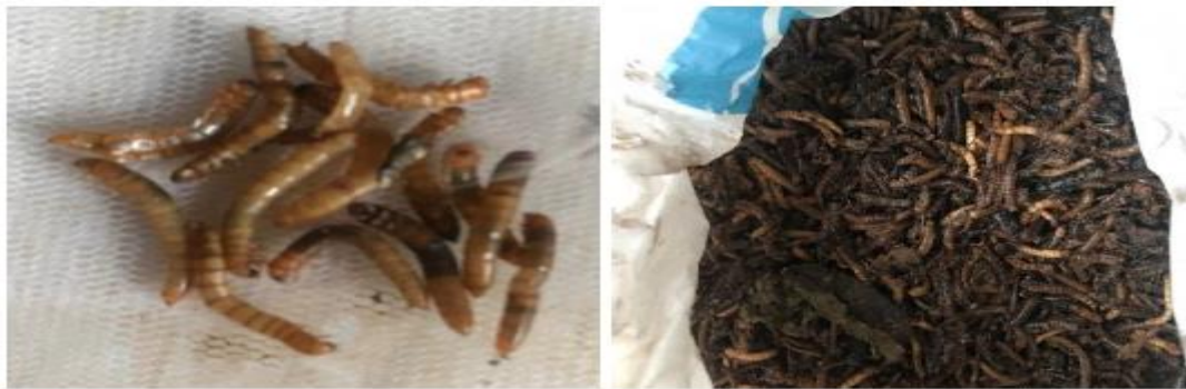
Picture 5. Waste skin of caterpillar of T. molitor

S. dichotomis conducted union at aged 6-10 days. The behaviour monitoring of the union S. dichotomis namely; the appearing of desire (arousal), approaching, the male position over the female (riding over), copulate, and after-copulate.