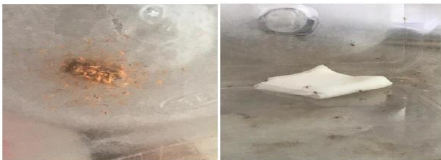
Picture 8. Nymph of instar 1 S dichotomus