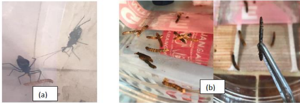
Picture 4 (a) S. dichotomis predated the caterpillar of T. molitor (b) Clean up the waste caterpillar skin of T. molitor using tweezers