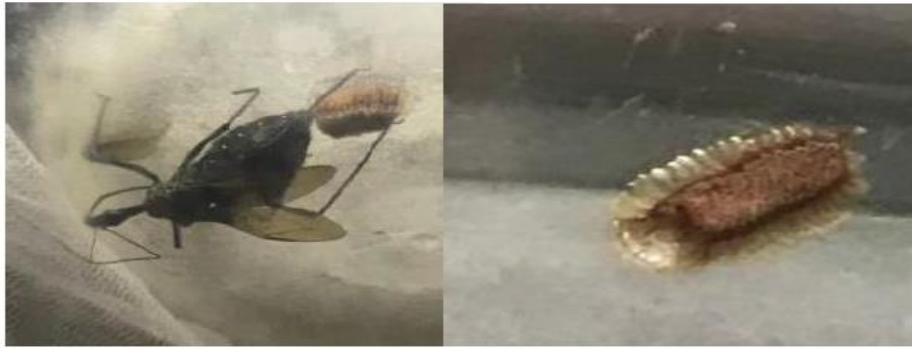
Picture 7 . S dichotomus was put the eggs.

The maintenance activity of eggs conducted with using 15 of eggs' group and one egg's group placed into one jar that covered by tissue. Eggs separated until become nymph and the growth of eggs stadia become nymph reaching 95-97%.