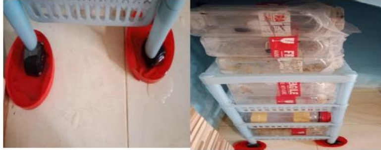
Picture 3. Propagation Shelf

pests entering into jar, and shelf footwear cleaned every five days so that it can not be the place for mosquitoes to lay eggs.