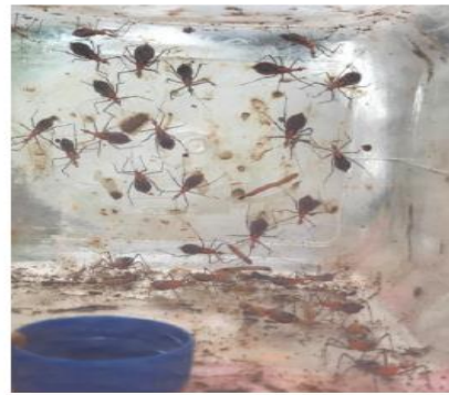
Picture 12 (a) S dichotomus of instar 5 (b) Propagation of Instar 5 of S dichotomus