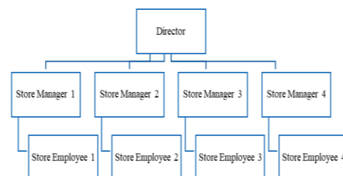
Figure 3.1 Risk Management Team Organization Structure

In the framework of risk management, leadership and commitment have a big role. To implement risk management in accordance with these aims and objectives, a risk management team is formed that will be responsible for the sustainability of the company. The risk management team will be led by the director as the management representative.