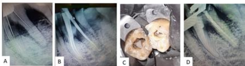
Figure 2(a): Working length determination (b) master cone confirmed radiographically (c) Clinical photograph post MTA placement (d) Radiograph confirming the correct placement of MTA