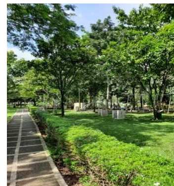
Figure 6. Vegetation Conditions at Cadika Park, Medan Johor

The arrangement of the play area which includes the placement of playing facilities or other supporting components is quite good, it's just that the maintenance is