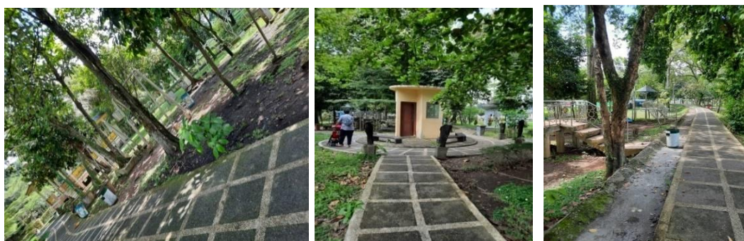
Figure 4. Accessibility at Cadika Park, Medan Johor

The play facilities in the play area are very easy to understand for children to use, either individually or in groups which can be noticed when children play, which generally do not require adult assistance to use these facilities.