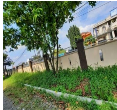
Figure 5. Security Post at The Main Gate of Cadika Park, Medan Johor