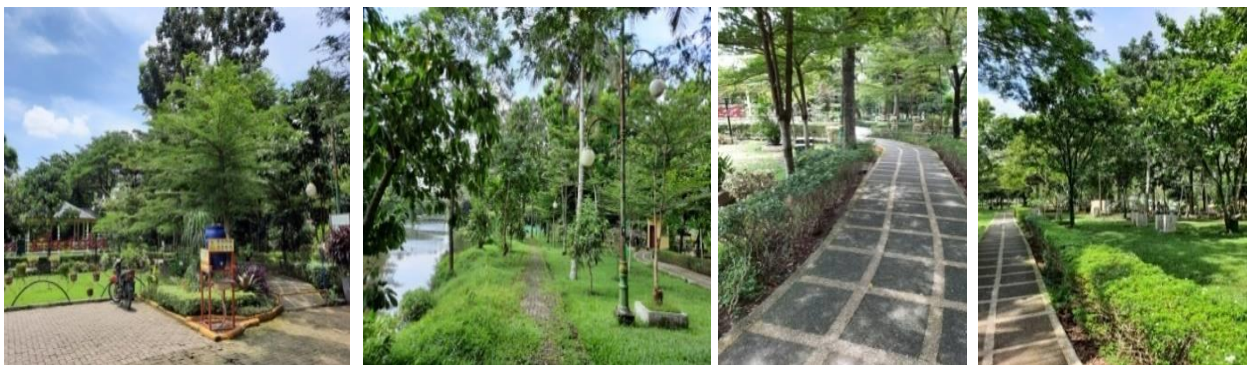
Figure 3. Conditions of Pedestrian Areas at Cadika Park, Medan Joho

The noise level in the Cadika Park area, either to the road or between the facilities contained therein, is very minimal, considering the distance between Cadika Park and the highway is quite far, as well as the distance between facilities within Cadika Park. The use of materials contained in the surrounding play area play facilities, pedestrian areas or sitting areas are considered less comfortable for children considering that almost all materials use hard materials such as concrete or iron.