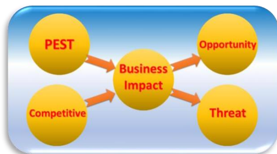
Figure 2.1 Framework External Factor

"Bilik Hukum" is accessible to the public because it is digital and can be