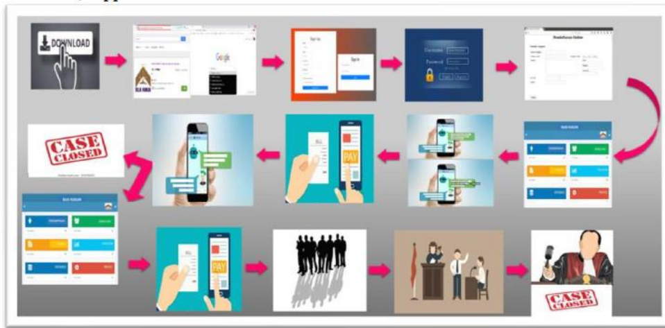
Figure 1.1. Law Booth Application and Website Business Flow

"Bilik Hukum" is accessible to the public because it is digital and can be accessed through available applications or websites, making it accessible to all. There are various legal services to choose from on this Bilik Hukum's app and website so that