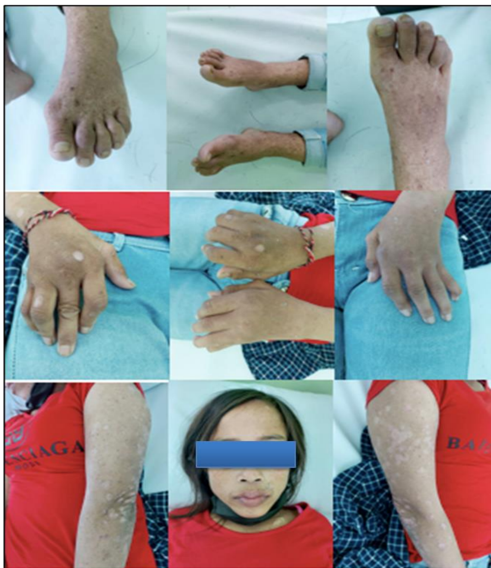
Fig. 1: Clinical photograph of the patient

On skin examination, it was found with multiple silvery-white erythematous plaques, varying in size, geographical shape, covered with fine white scales spread all over the body skin (Figure 1).