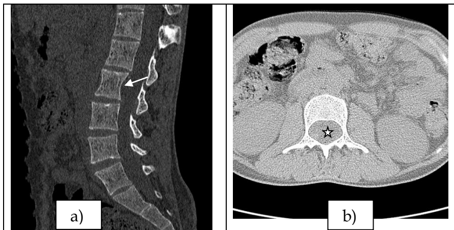
Figure 2: NCCT of lumbosacral spine a) Sagittal reformat in bone window showing lesion is seen in the spinal canal posterior to L2 vertebral body, causing widening of the spinal canal with associated scalloping (white solid arrow). No destruction of the bone is seen. b) Axial reformat in soft tissue window showing a soft tissue density intramedullary lesion in the spinal canal posterior to L2 vertebral body (Asterisk *).