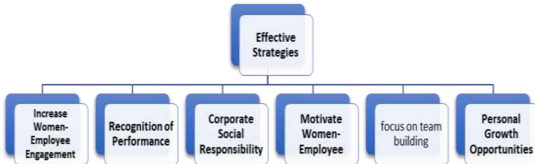
Figure 2: Retaining Women strategies

These should be more creative with policies that address work-life balance, including flexible work arrangements, often gives them an advantage over larger companies in creating a positive work environment that encourages employees to stay. Also it could give its your employees low-cost perks that they'll appreciate greatly.