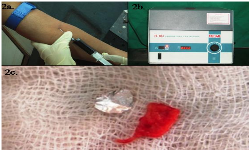
Fig. 2: Preparation of Platelet Concentrate. 2a) Drawing of blood from the antecubital vein. 2b) Centrifugation of the blood contained in the test tubes. 2c) Preparation of PRF membrane