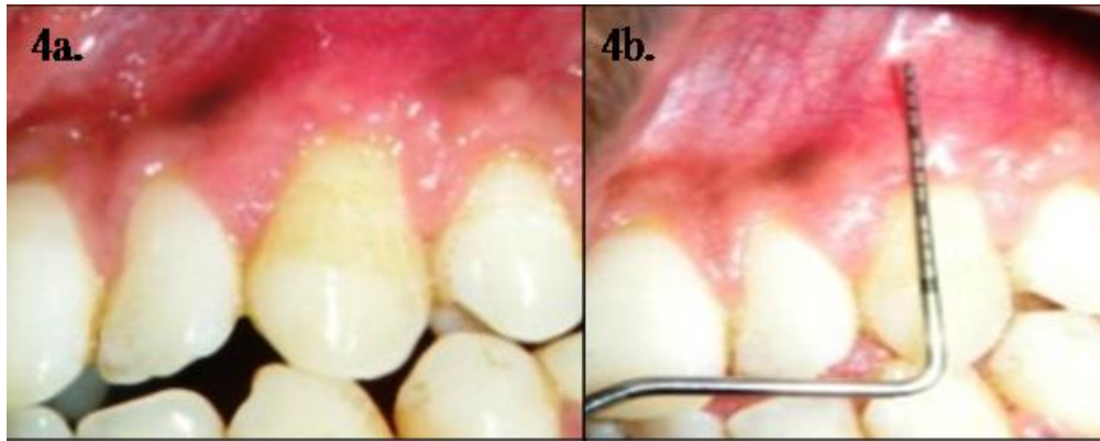
Fig. 4: Postoperative clinical photographs. 4a) Clinical photograph 10 days after surgery 4b) 6 months post surgery

removed 10 days after the surgery. There was almost 100% root coverage at the time of suture removal. (Fig. 4a) The patient was reevaluated after 6 months. The results persisted even at the end of 6 months and there was a significant increase in the width of attached gingiva. (Fig. 4b)