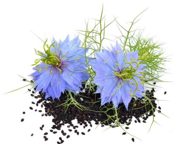
Figure 1. Nigella sativa (Kalonji)

about 44 cm to 60 cm. Leaves are divided into two linear segments long up to 3cm. They are opposite in pair on either side of the stem. The lower leaves are small and petiolate whereas the upper leaves are long. The plant has divided foliage. Flowers are pale blue on solitary long peduncles. It grows terminally on its branches. Seeds are trigonous and black in color. N. sativa reproduces with itself and forms a fruit capsule that consists of many white trigonal seeds when the fruit capsule matured. Fruit opens up automatically and the seeds within are exposed to the air becoming black and it is also known as black seeds. Seeds are triangular in shape, black in color and possess a pungent smell. It contains a considerable quantity of oil [16,17]