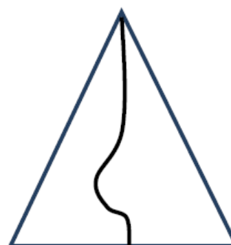
Fig-2: Removal and inverse repositioning of the side