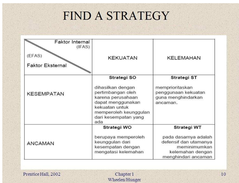
Model Gambar Manajemen Strategis Hunger, Wheelen (SWOT)

can be used more in the manufacture of the SWOT matrix (SWOT matrix) or better known as the matrix of TOWS (TOWS matrix). (Hunger and Wheelen, 2006, p. 144). Matrix TOWS can illustrate the opportunities and external threats faced by a company can be combined with internal strengths and weaknesses of the company.