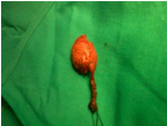
FIGURE LEGEND—1. BRANCHIAL SINUS TRACT WITH CYST

sternomastoid. There was no history of fever or cough. The discharge was small in amount and whitish in colour. The Haemogram was within normal limit. Sinogram was not successful. Sonography of neck was not done as there was no palpable lump. Patient was operated in view of branchial sinus but surprisingly there was small cyst at the end of sinus tract. The sinus tract along with cyst was completely excised.