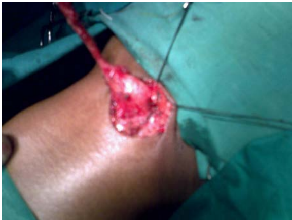
FIGURE LEGEND—2. SINUS TRACT COMMUNICATING WITH CYST