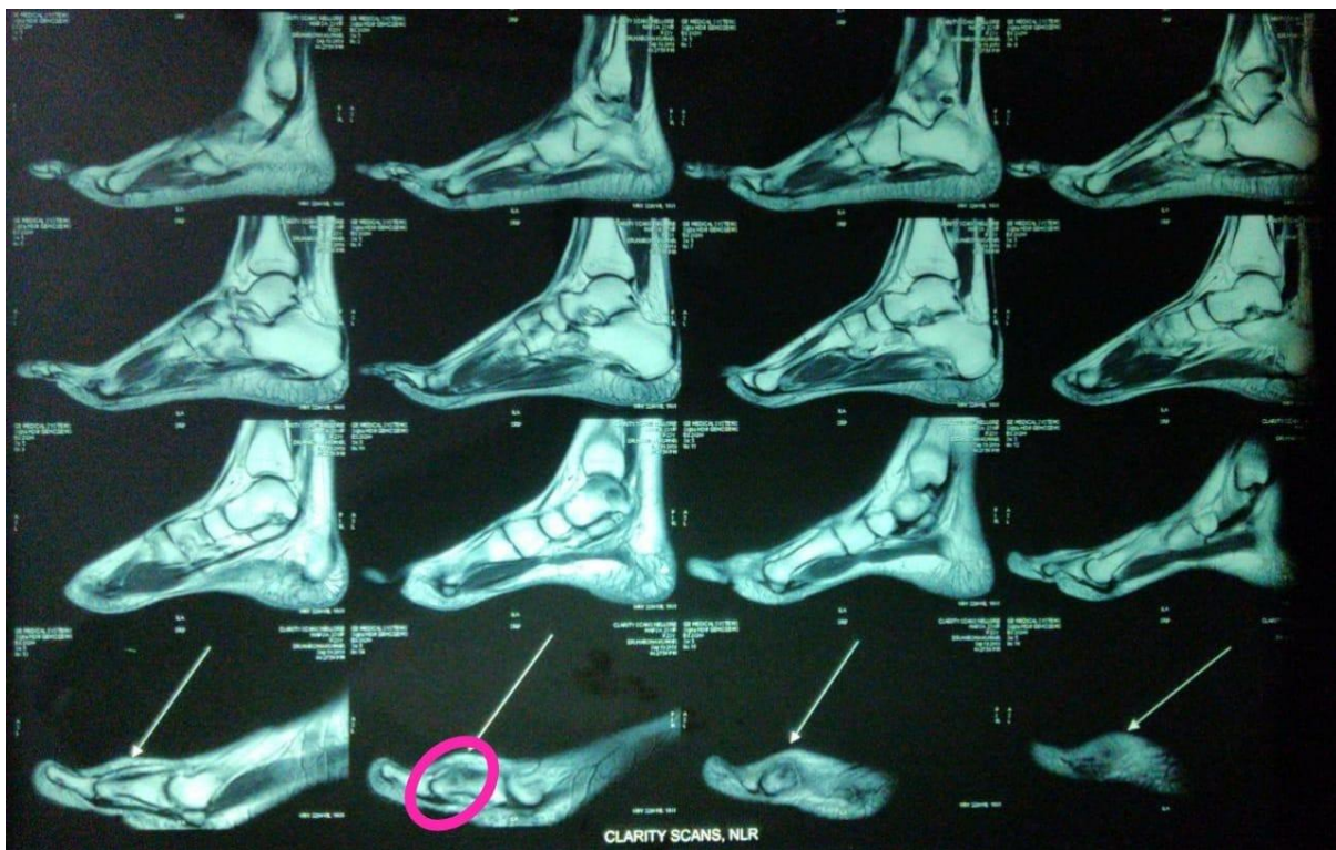
Fig-2: MRI image shows T1 Hypointense, T2 and STIR hyperintense Lesion in the dorsal aspect of the proximal phalanx of the great toe... Suggest the possibility of Osteoid osteoma.

multiple grey white bony bits altogether measuring 1x1 cm. Microscopic examination shows lesion composed of irregular mature bony trabeculae with immature bone which is rimmed by osteoblasts. Intervening stroma shows fibroblasts and many congested blood vessels. A final diagnosis of osteoid osteoma was made based on histopathological features. Patient was uneventful and showed good recovery after two months.