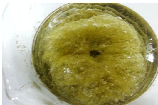
Figure 1 – A. augustum mucilage

powdered. The leaves were crushed and soaked in water for 6 hours, allowed to complete release of the mucilage into the water. The mucilage was extracted using a muslin cloth bag to remove the marc from the solution. 95% of ethanol (in the volumes of three times to the volume of filtrate) was added to precipitate the mucilage. The mucilage was separated, dried in an oven at 40°C, ground, passed through a # 80 sieve and stored in a desiccator at 30°C and 45% relative humidity till use (Figure 1). [8]