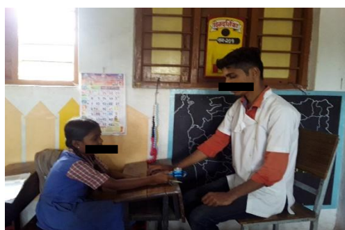
Picture1-Assement of palmar pinch strength

Each participant was asked to write 10 lines on A4 size paper within six minutes time, then written content was assessed by HLS (Handwriting legibility scale) and HLS score was noted.