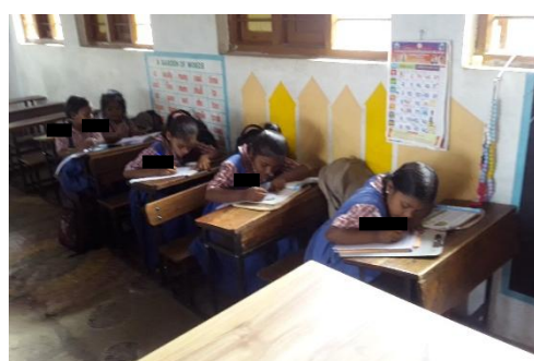
Picture 2-Assesment of handwriting

The position was according to that given by American Journal of Occupational Therapy. For each test of pinch strength, the subjects were seated with their shoulder adducted and neutrally rotated, elbow flexed at 90°, forearm in neutral position and wrist between 0-15° extension and between 0-15° ulnar deviation. 9 A Baseline mechanical gauge was used to measure palmer pinch strength in kilograms. For each strength test, standard instructions were followed, and