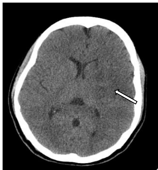
Figure 2: Plain CT Brain Axial view