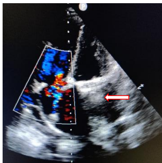
Figure 3: 2D Echo Heart