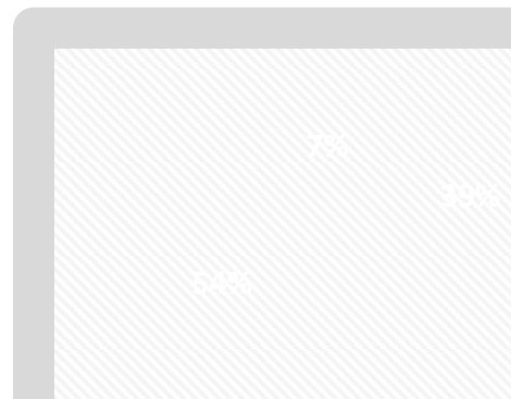
Figure 1: Distribution of subjects based knowledge regarding neutropenia.

The data depicted in figure 1 illustrates that 54(54%) of the subjects had moderate