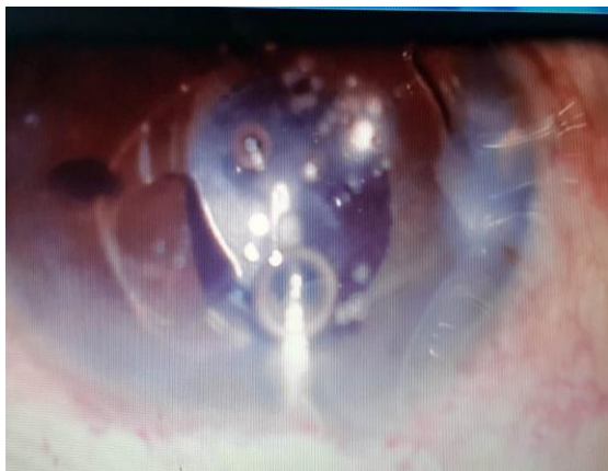
Figure- 1. Insertion of Iris-claw lens.

due to pupillary block. In these cases we had not done iridectomy during intraocular lens implantation. Intraocular pressure remained >20 mmhg postoperatively in these cases. Retinal detachment was observed in one eye. In one eye we had subluxation of iris-claw intraocular lens which was refixated properly without any difficulty. Rest in all the cases the lens was central and in stable position (Figure-2). On the lens surface pigment dispersion was noted in two eyes, and in one eye iris atrophy was noted at enclavation site. Irregular pupil was noted in one eye. We have not seen any case of bullous keratopathy, infection or cystoid macular edema till last follow-up.