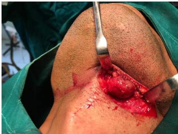
Figure 2. Exposed cyst.