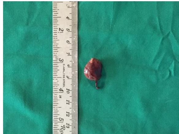
Figure 3. Excised specimen of cyst