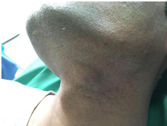
Figure 1. Swelling in Paramedian region of neck

The H & E stained sections showed epithelium and connective tissue arranged in a cystic configuration (fig 4). The cystic lumen was filled with abundant orthokeratin. The epithelial lining was orthokeratinised stratified squamous type only few layers thick and with a flat interface with the underlying connective tissue. The connective tissue stroma was made of mature collagen fibre bundles which were superficially arranged parallel to the epithelial lining and appeared irregular in deeper parts. The diagnosis was paramedian epidermoid cyst. The patient was well post operatively and was placed on yearly follow ups.