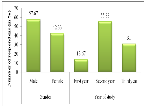
Figure 1 Personal profile of the students

In the selected 300 students, 57.67% of them are male and the remaining are female (42.33%). 55.33% of the students are studying in second year whereas 31% of them in third year and 13.67% of the students are studying in first year.