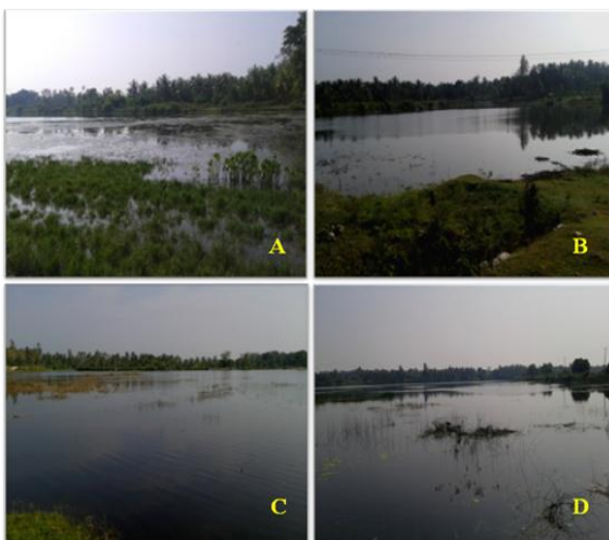
Fig: 3 Photographs showing views of lakes and sampling sites of A) Natanahalli lake; B) Kurubahalli lake; C) Yelemuddanahalli lake; D) Katnal lake