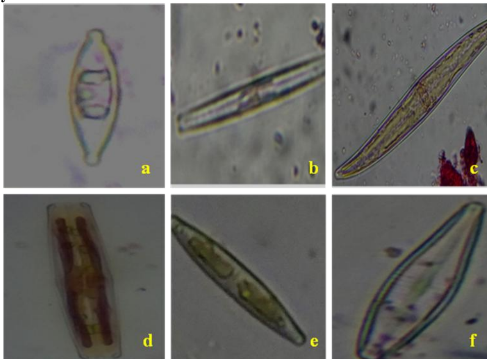
Fig: 4 a- Stauroneis phoeicenteron (SPHO); b- Fragilaria brevistriata (FBRE); (c) Gyrosigma acuminatum (GYAC); d- Pinnularia acrosphaeria (PACR) ; e- Navicula rynocephala (NRHY); f- Gomphonema gracile (GGRA).