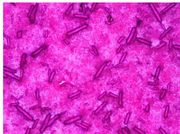
Figure 1: Smears with numerous rectangular shaped crystalloids with parallel sides (H&E, X100)

aspirated. After aspiration swelling subsided. Fine needle aspiration smears were prepared and stained with Haematoxylin & Eosin. Smears revealed numerous rhomboid & rectangular shaped crystalloids with parallel sides ( Figure 1 ). Some of them showed pointed ends. Few foci showed epithelioid cell clusters ( Figure 2 ) & multinucleated foreign body giant cells ( Figure 3 ).