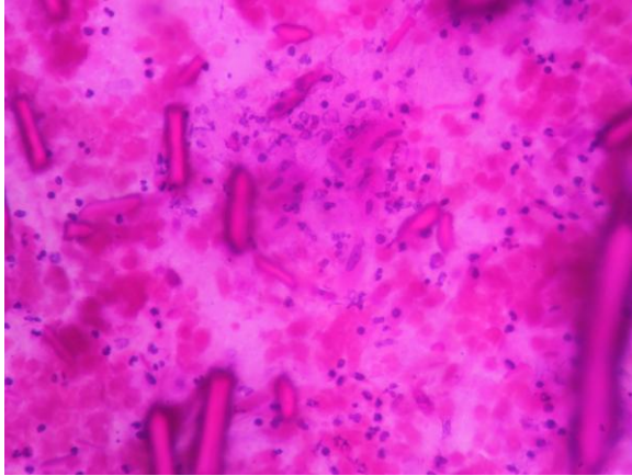
Figure 2: Smears showing crystalloids with adjacent epithelioid cell cluster (H&E,X400)

Foamy macrophages were noted in some foci. Background showed eosinophilic necrotic debris. No acinar or ductal elements were seen. Cytological diagnosis of benign cystic lesion with the possibility of retention cyst of parotid was made.