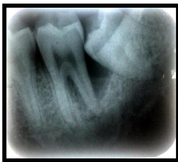
Figure 2 baseline radiograph (left mandibular second molar)

Standardized radiographs were evaluated at baseline 6months and 1year (Figure 2 and 3).