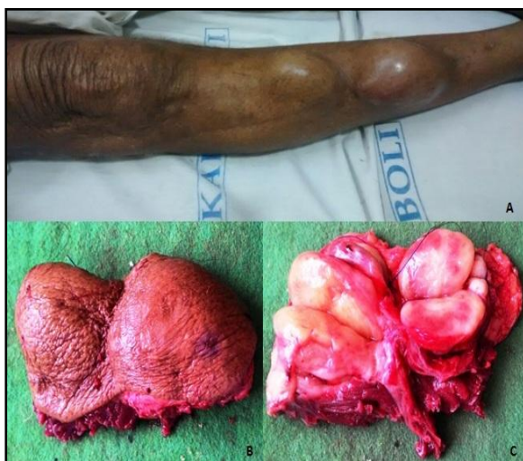
Figure 1A & 1B - Skin covered mass measuring 18x 9 9x2cm in size, along with scar seen on lateral aspect of right leg. Figure 1C - Cut section of the mass shows Yellowish tan coloured homogenous mass with no areas of necrosis and hemorrhage.

The patient underwent wide local excision of the mass and the specimen was sent for histopathological examination. On gross examination, mass was skin covered measuring 17x 8.5x1 cm with two circumscribed, firm nodules, largest measuring 7x7x5 cm and smallest measuring 5x4x3.5 cm. On cut section the mass was yellowish tan coloured with no areas of hemorrhage or necrosis seen. (Figure 1-A, B, C). Hematoxylin and Eosin stained sections studied showed tumor cells arranged in fascicles, vague storiform pattern at the periphery showing marked myxoid degeneration along with both neoplastic proliferation of fibroblasts and histiocytes. The histiocytes being round to oval with vesicular nucleus and indistinct cytoplasm. Mild degree of nuclear pleomorphism and occasional mitosis was seen along with increased blood vessel proliferation. (Figure 2A & 2B ). Immunohistochemically the tumor cells were positive for CD 34, focally positive for SMA, Ki-67 showed 40% proliferative index and were negative for S- 100, Pan Ck and Desmin thus confirming the diagnosis of DFSP with myxoid variant. (Figure 3- A,B,C,D & E)