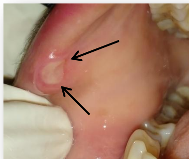
Fig2: Major Recurrent Aphthous Stomatitis (Black Arrow)

MjRAS accounts for approximately 10–15% of cases, [3] The ulcers tend to be larger than those of minor aphthae, and they are of greater duration, up to a period of months in some cases. [14]