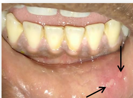
Fig1: Minor Recurrent Aphthous Stomatitis (Black Arrow)

This is the most common form of RAS and approximately 80% of patients has lesions of this type. [3] The characteristic picture of minor aphthous consists of a number of small ulcers (one to five) appearing on the buccal mucosa, the labial mucosa, the floor of the mouth or the tongue.