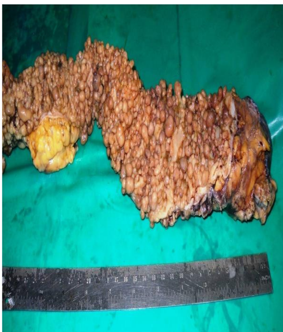
Fig. 1: Gross Specimen with numerous Polyps.

A 35 yr-year old woman was admitted with an 8-month history of passage of mucoid diarrhoeal stool, weight loss and generalised body weakness. Has no known family history of similar problem. On physical examination, the patient was weak and pale. Her abdomen was soft, non tender, non-distended, without organomegaly, masses or ascites and rectal examination revealed normal findings. Laboratory investigation demonstrated haemoglobin of 7gm/dL and haematocrit of 21 %, stool occult blood test was positive and carcinoembryonic antigen was normal (1.0ng/ml), both serum electrolytes and liver function tests were normal. Colonoscopy revealed multiple polyps, involving whole colon sparing rectum and histology confirmed adenomatous polyposis coli. She was optimised and subsequently had total colectomy and ileorectal anastomosis. Patients recovered well and discharge home to be followed in out-patient clinic. Family members were counseled for screening.