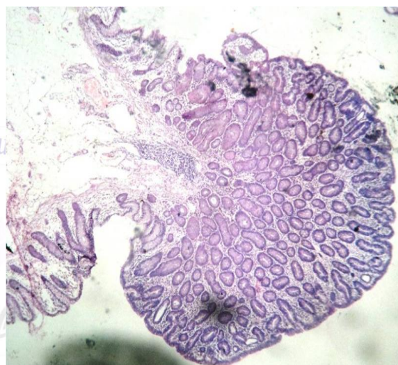
Fig. 2 (b): Histologic Slide of Adenomatous Polyp