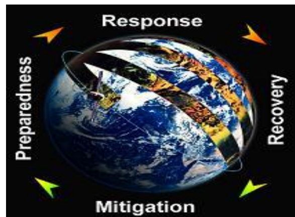
Figure 1. Space Technology

rapid-mapping in all phases of the disaster management cycle, mitigation of potential risks in a given area, preparedness for eventual disasters, immediate response to a disaster event, and the recovery/reconstruction efforts following it. [7] Global navigation satellite systems (GNSS) such as the Global Positioning System (GPS) help all the levels by providing accurate location and navigation data, helping manage land and infrastructures, and aiding rescue crews coordinate their search efforts. Communications through satellites allow the transfer of information (voice, images/maps, video) when usual communications cadre are disabled by the disaster event. [7] The emergency communications carried out using semi-mobile terminals and handheld satellite phones are particularly useful during immediate response activities, including damage assessment, search and rescue efforts, news reporting, aid coordination, and telemedicine activities. [7]