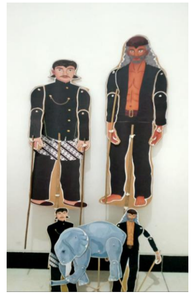
Figure 3. The result is a figure illustration