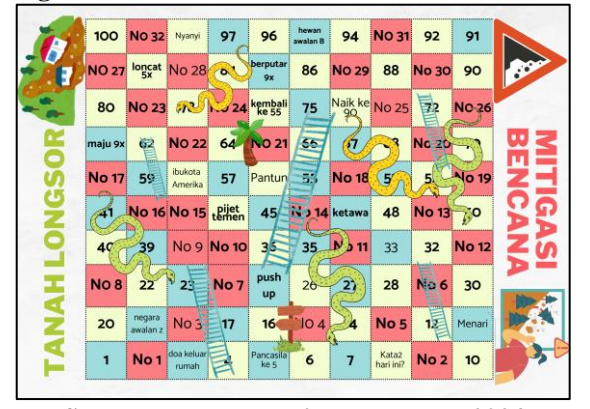
Figure 2. Snakes and Ladders Educational Game

Based on Figure 1, Ngijo Village, Gunung Pati District is an area that is vulnerable to landslides. This can be seen from Figure 1, that Ngijo District is dominated by the highest level of landslides, namely the medium criteria (yellow) and the high criteria landslide level (red) dominates the second position. The influence of the high risk of landslides in Ngijo District is that the hilly topography and unstable soil conditions make it prone to ground movement, especially during the rainy season. This is also supported by the increasing threat of the existence of forests due to land conversion, namely from forests turning into settlements. In the snakes and ladders educational game created in this research. it presents information in the form of landslide mitigation disaster information with an attractive appearance.