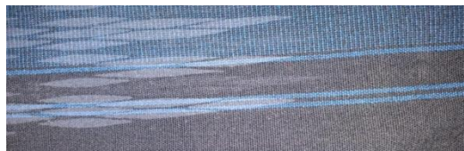
Motif gatip dabbal

implied philosophical message is that these three elements are a complementary part of life's journey.