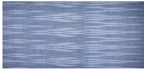
Motif kelang pajonggir

The kelang pajonggir motif is one of the motifs found on the pardabaitak polish. Kelang pajonggir, which means a type of gecko, plays an important role in maintaining natural harmony and bringing