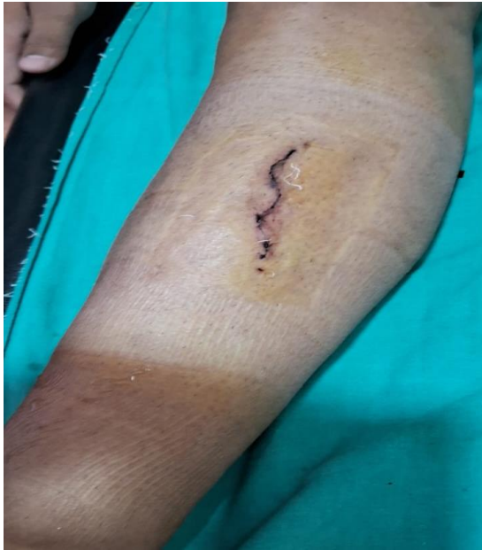
Photograph showing post operative closure of wound

A minimally invasive fasciotomy centered over the hernial orifice and extending proximally and distally allows complete recovery and return to pre-injury sport levels of activity (7) .