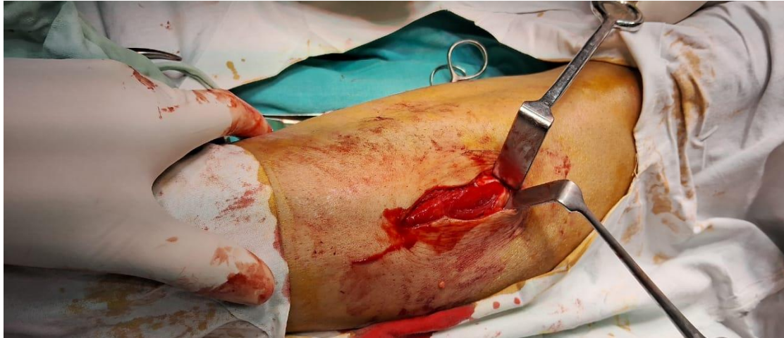
Photograph showing defect in fascia of tibialis anterior muscle

Fasciotomy was done as defect was not getting approximated and tight fascia was above and below the defect, hence fasciotomy was performed.