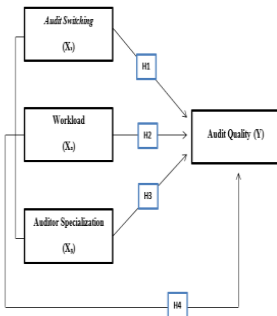
Figure 1. Framework

H1: Audit Switching has a positive and significant effect on audit quality.