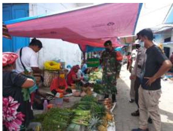
Figure 2. The traditional market in Kutalimbaru

district office to the capital city The district is 124 km while the distance between the sub-district office and the capital city Province 68 km. Kutalimbaru sub-district has a climate like other villages in the territory of Indonesia has a dry climate that lasts for 222 days and rain lasted for 143 days (Data: Central Bureau of Statistics Kecamatan Kutalimbaru in 2020 Figures).