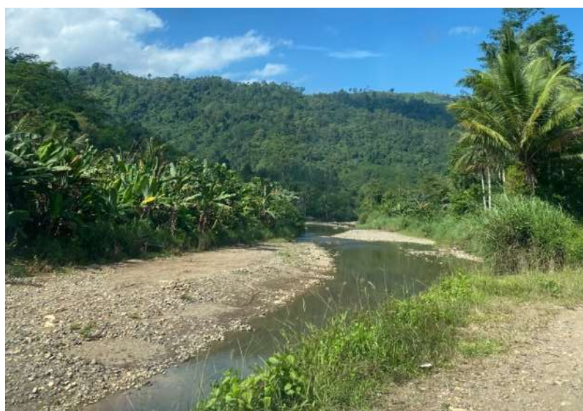
Figure 3 Condition of the Way Napal River

Level Flood vulnerability and the high number of flood events in Kelumbayan Sub-District make the residents of Kelumbayan Sub-District affected by flooding. The impact of the flood was in the form of damage to public facilities and buildings, loss of property, and material losses due to damage to agricultural land and crops. Residents in Kelumbayaan District must adapt to flood-prone conditions in their area.