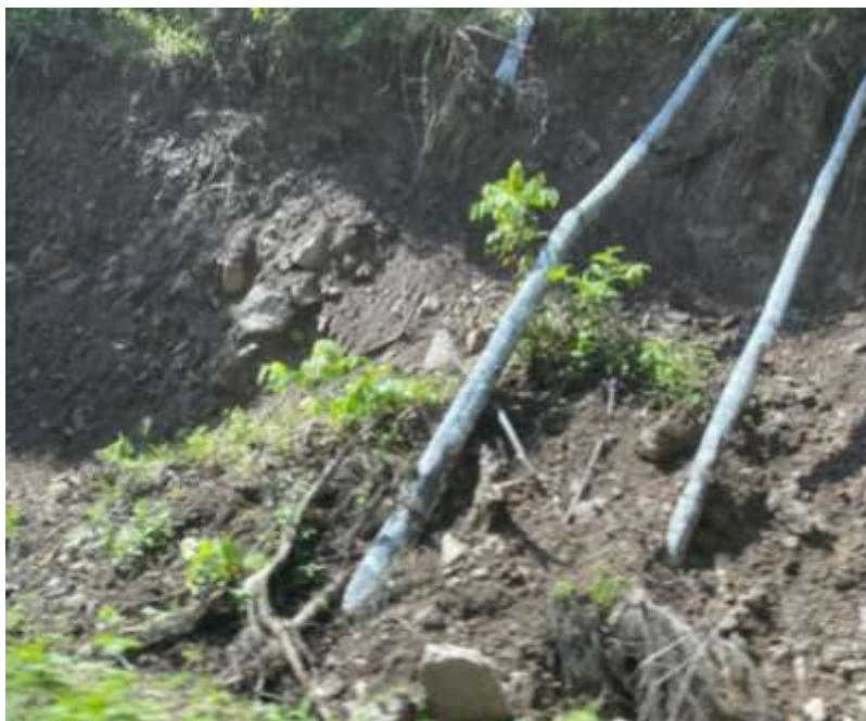
Figure 4 Post-Flood Conditions

understanding of knowledge and participation regarding flood disaster risk reduction (Putra et al, 2021: 2).